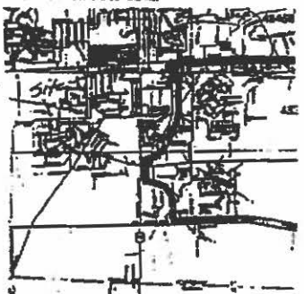
Vicinity Map No Scale