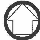
EXHIBIT A PROJECT NO. 09487