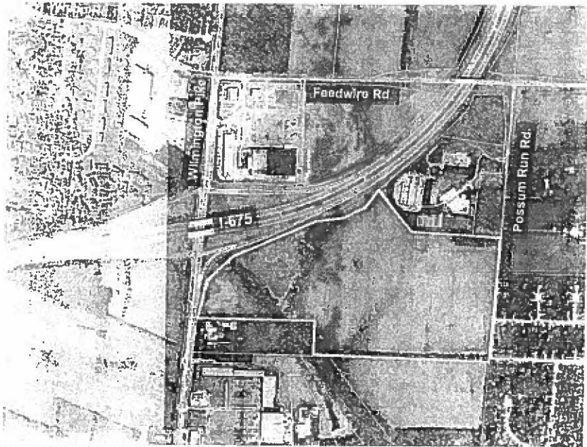
Map K-1: Study Area Limits

(Study Area Location and Boundaries) Study Area K is located on the eastern edge of the City of Centerville along Possum Run Road between an existing residential subdivision and the retail and commercial corridor along Wilmington Pike in Sugarcreek Township. This Study Area was recently annexed into the City of Centerville and is situated in Sugarcreek Township in Greene County.