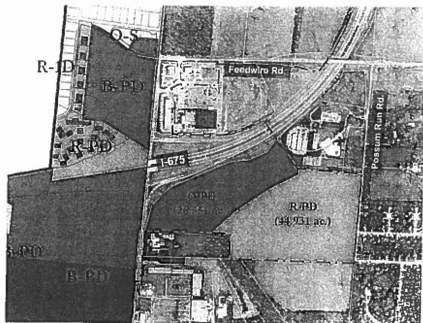
Map K-2: Existing Zoning

(Adjacent Land Uses) Study Area K is bounded to the west by a large retail center anchored by Cub Foods, Hope United Methodist Church, Sugarcreek Township Fire and Police Substation, and parkland. The eastern boundary of the Study Area is bordered by single-family residential. Land along the southern boundary is vacant. The Five Seasons Country Club is located on the north side. Zoning districts located outside the Study Area but within the Wilmington Pike corridor include Sugarcreek Township B-2, Neighborhood Business on the east side and Centerville B-PD, Business Planned Development on the west side. This level of zoning provides for regional and large format retail centers.