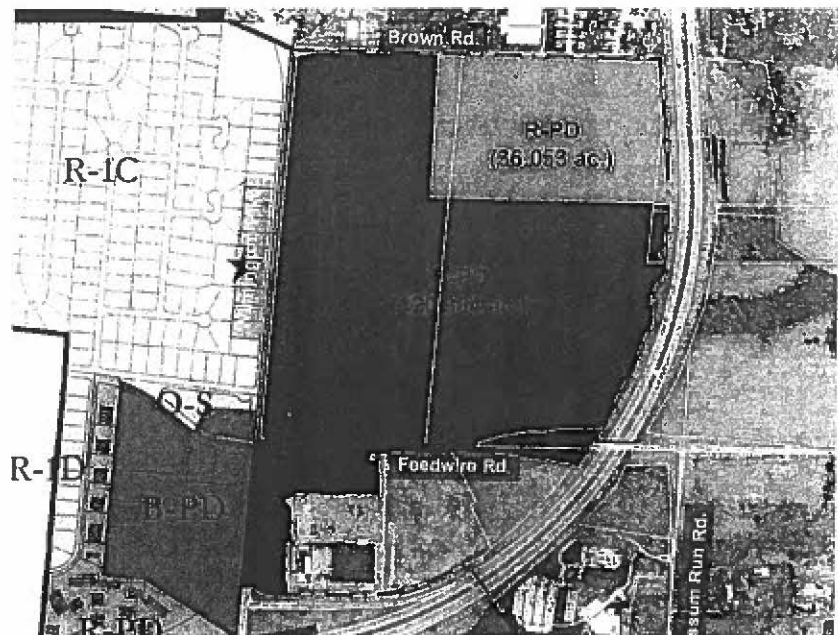
Map J-2: Existing Zoning

(General land-use and adjacent land-use) According to the zoning code, the B-PD district “is designed to permit greater flexibility, and consequently, more creative and imaginative design for the development of business areas than is generally possible under conventional zoning regulations. It is further intended to promote more economical and efficient uses of larger tracts of land.” The district requires a development plan to be submitted, but does not include development standards that establish the form that development should take or how the development should incorporate the natural characteristics of the site. The district also permits a wide variety of commercial uses and restricts overall height to 45 feet. Setback provisions in B-PD districts create large side and front yards, and allows for only 50 percent of the land parcel to be developed.