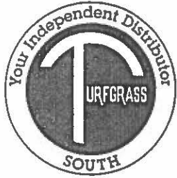
EXHIBIT "B" TURFGRASS SOUTH, LLC

7968 KENTUCKY DR. STE. 2-4 P.O. BOX 637 FLORENCE, KY 41022-0637