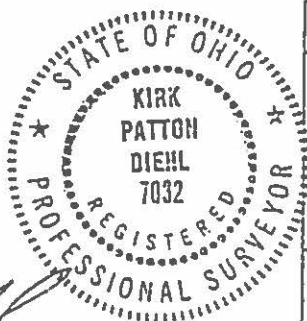
EXHIBIT TO EASEMENT

CITY OF CENTERVILLE SECTION 20, TOWNSHIP, RANGE 6MRS. CITY OF CENTERVILLE MONTGOMERY COUNTY OHIO