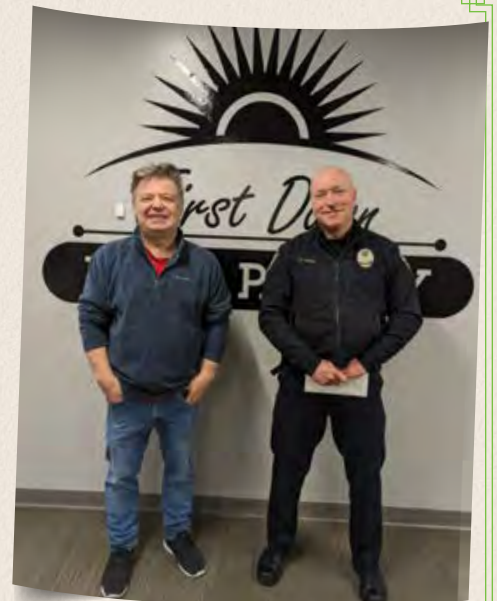
Centerville Police employees raised $575 to support First Dawn Food Pantry.