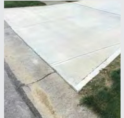
Examples of a poorly constructed driveway (above left) and a well constructed driveway