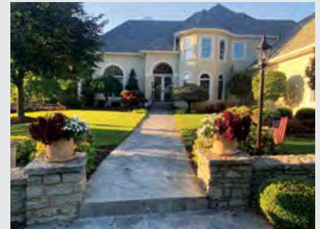
This home on Preserve Place was a 2022 award winner!

Notice beautiful landscaping this summer in your community? Nominate these homeowners for recognition in the City Beautiful Summer Landscape Awards at centervilleohio.gov/citybeautiful .