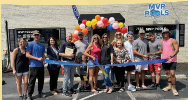
Grand opening celebrations of MVP Pools

THANK YOU FOR SUPPORTING ALL OUR CENTERVILLE BUSINESSES.