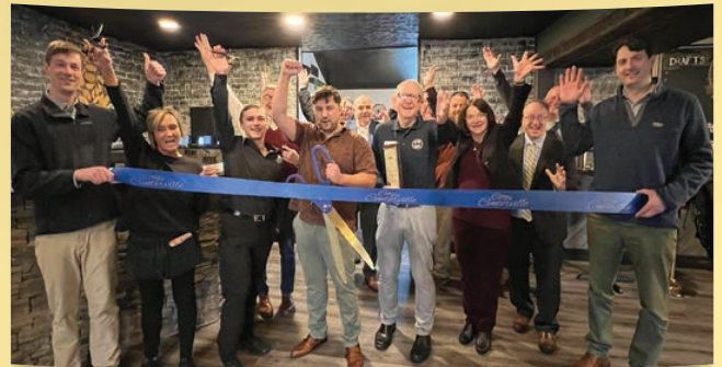
Ribbon cutting celebration of Brunch Pub.