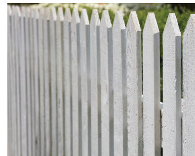
Picket; Any Yard