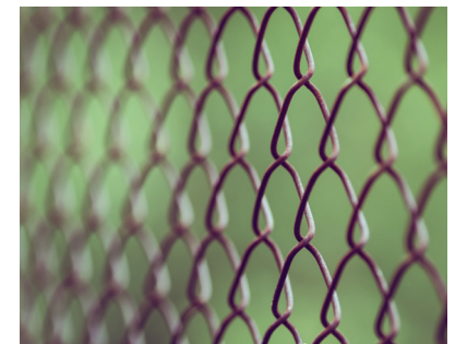
Chain Link; Side or Rear Yard