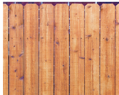
Privacy; Side or Rear Yard

Use the images below to choose the correct fence design for the proposed fence location on your property.